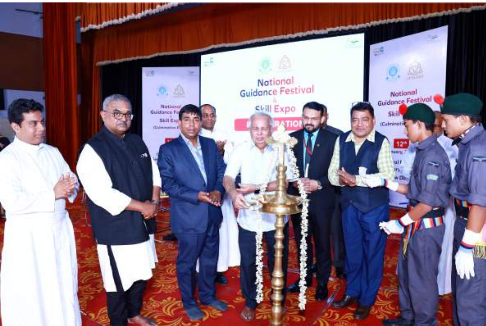
Lighting the traditional floor lamp