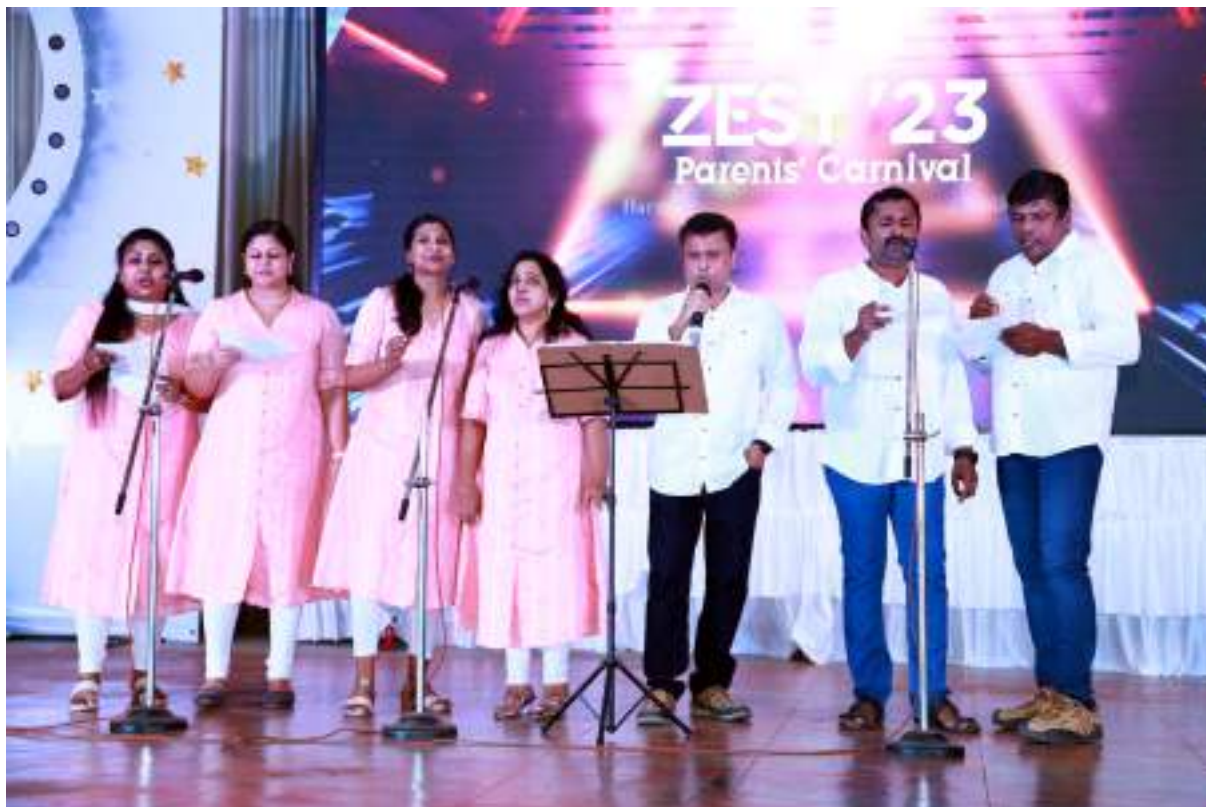
Team Swara Tarang featuring