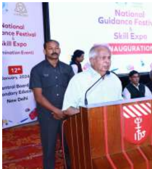
Padma Vibhushan Dr. G. Madhavan Nair