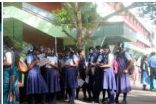
Arrival of students from across the country: Reception, Registration and Refreshments