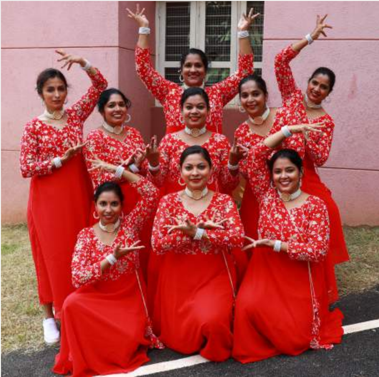
Team NAVATARANG featuring