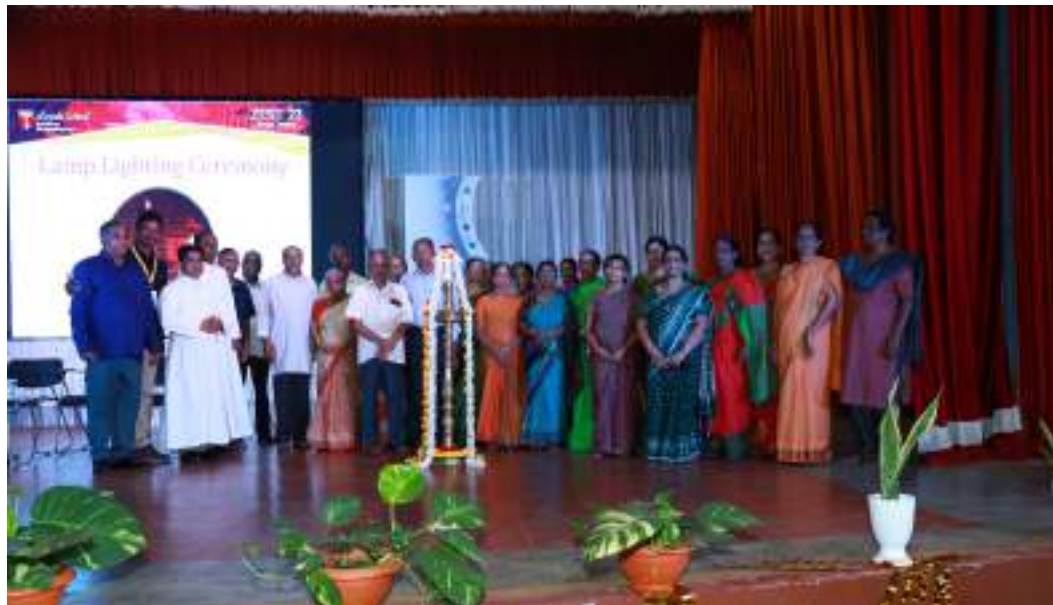
Parents, grandparents and great grandparents after lighting the lamp