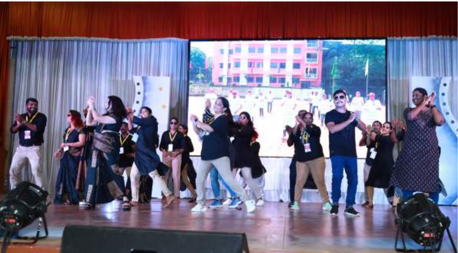
The Host Team erupting into rapturous gyrations at the roaring success of Zest '23