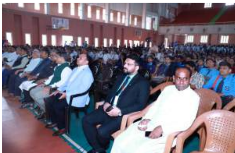
The luminaries on the first row just before the start of the formal inauguration