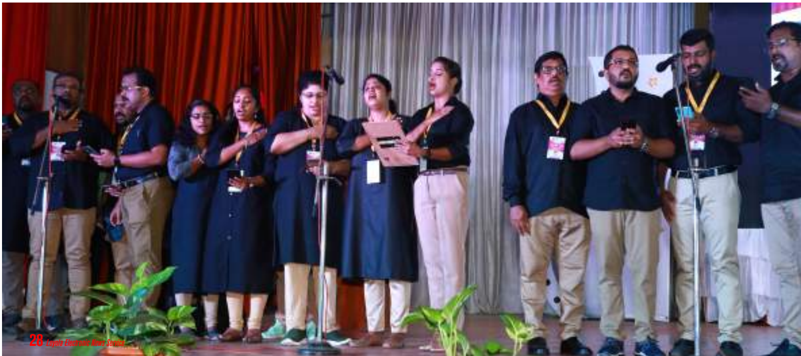
Perfect rendition of the School Anthem by the parents